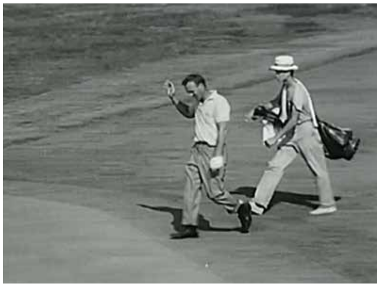
BOBBY NICHOLS (ABOVE) BEAT ARNOLD PALMER (RIGHT) AND JACK NICKLAUS IN THE 1964 PGA CHAMPIONSHIP AT COLUMBUS CC.

“WE’RE EXCITED TO REOPEN THIS MASTERFULLY RENOVATED COURSE TO OUR MEMBERS, AS WELL AS OTHER PRIVATE CLUB MEMBERS WHO HAVE ACCESS THROUGH THE TROON PRIVÉ PRIVILEGE PROGRAM.”